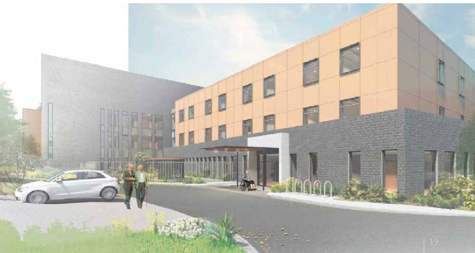
Gander Long-Term Care Home